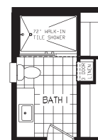
72" WALK-IN TILE SHOWER OPT