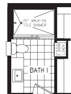
72" TILE SHOWER OPT