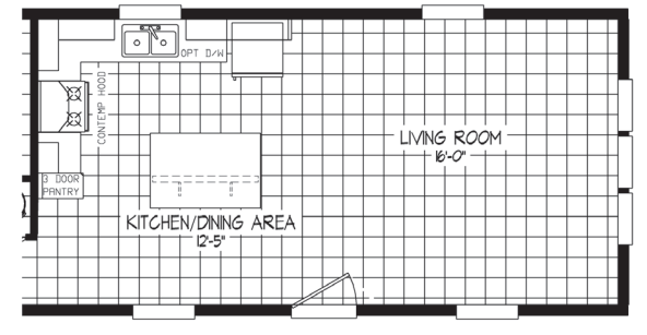
FRONT LIVING ROOM OPT